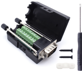
515-6-9119 VGA3+9 15pin Male Connector with jackscrew nut

Contact Current Rating: 5A max. Insulation Resistance: 1000MΩ min. at 500 V/DC Dielectric Withstanding Voltage: 500 V/AC(R.M.S)/1 min. Operating Temperature: -20~85°C