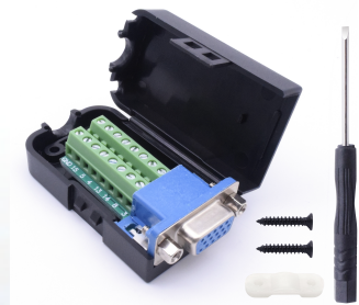
515-6-9122 VGA3+9 15pin Female Connector with locking screw