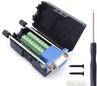
515-6-9120 VGA3+9 15pin Female Connector with jackscrew nut