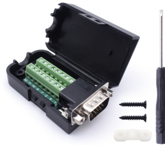
515-6-9121 VGA3+9 15pin Male Connector with locking screw